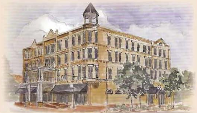
HOTEL CHIQUOLA 102 W. WHITNER AT 101 N. MAIN