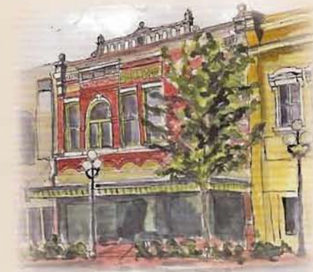
THE SULLIVAN HARDWARE STORE 208 S. MAIN

Constructed in 1888 on the site of the Old Waverly House, the four story brick Romanesque style structure has been modified through the years and much of its ornamentation is now gone. It does retain decorative brickwork, paired 1/1 windows (some arched) and oriels. (The oriel at the southeast corner is three stories high.) The façade also features brick corbelling and bartizans. Called the Plaza Hotel in the late 20th Century, the structure was renovated recently to the Chiquola Club and 15 luxury condominiums.