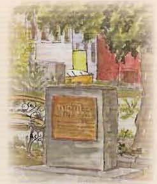
W. CHURCH STREET