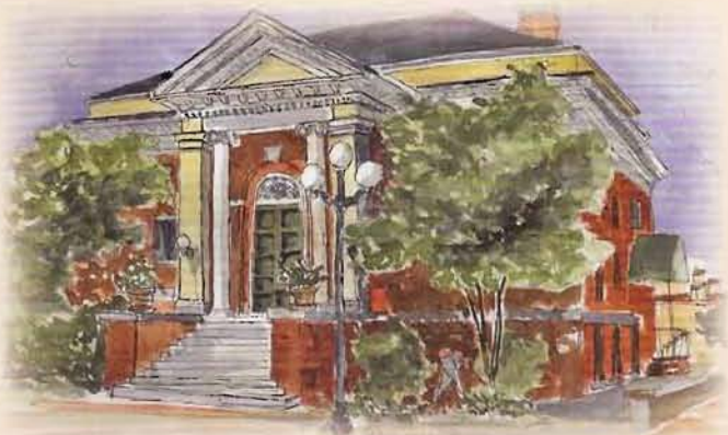
CARNEGIE LIBRARY 405 N. MAIN