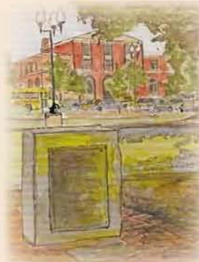
E. CHURCH STREET

This three story brick warehouse in the commercial Romanesque style was constructed in 1909, measuring 91' by 132'. Brick pilasters separate the façade of the building into arched bays. The structure also features a brick corbelled parapet. The structure was recently renovated by architect Frank Clark for professional office space.