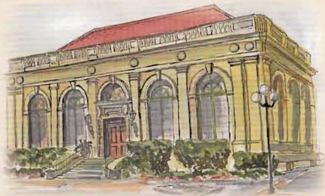
THE FEDERAL BUILDING 401 N. MAIN